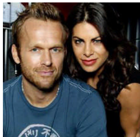
The Biggest Loser Trainers Bob Harper & Jillian Michaels

Here we turn to the minted diet experts from NBC's The Biggest Loser for free advice. And why not? After all, under the guidance of the show's ace team of doctors and physical trainers, many contestants lose more than 100 pounds in eight months — without surgery. Even more impressive, is that some of those people did it at home with no help from super trainers Bob Harper and Jillian Michaels, so they must be doing something right. If dropping a few is on your list of New Year's resolutions, consider the following: